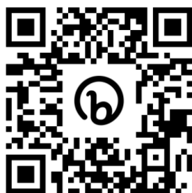
Syllabus for exams in 2022 and 2023

The updated syllabus is for examination from June 2024 onwards. Examinations are available in June and November .