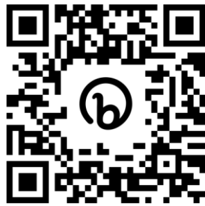
What You Need to Know