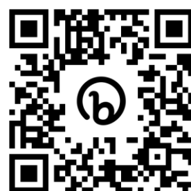
Syllabus for exams in 2024, 2025 and 2026